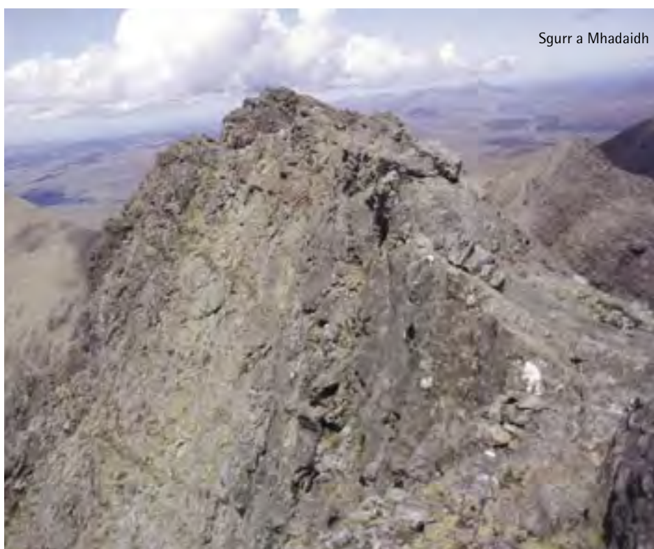
Sgurr a Mhadaidh