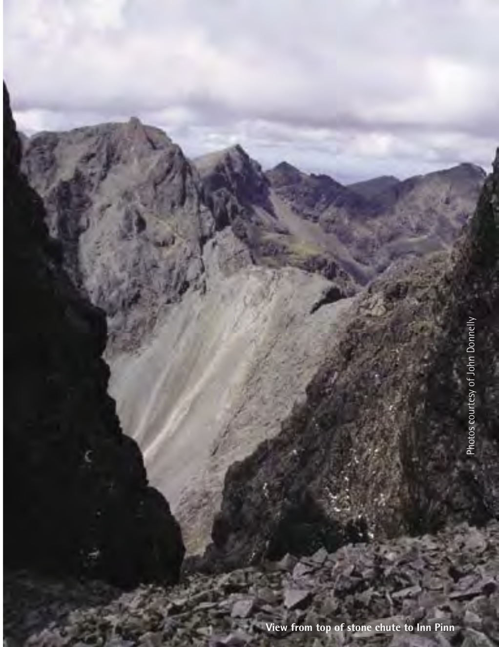
View from top of stone chute to Inn Pinn

The next challenge? The Transcuillin : a west-east traverse taking in every Cuillin top between Gars-bheinn and Beinn na Caillich, in less than 24 hours top to top (include everything with at least 50ft drop all round, minus a few outliers). 70 Tops, 38 mi, 29,000 ft.